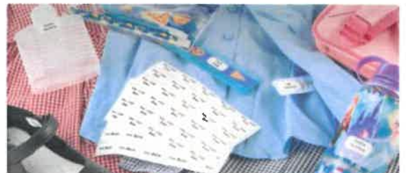
Name Labels | Clothes Name Labels For School | Name Tags | Stikins ©

The PTA is now part of the fundraising scheme organised by Stikins, a name label provider. If you make any purchases at https://www.stikins.co.uk and input our unique number 9566, the PTA will earn 30% commission for the school.