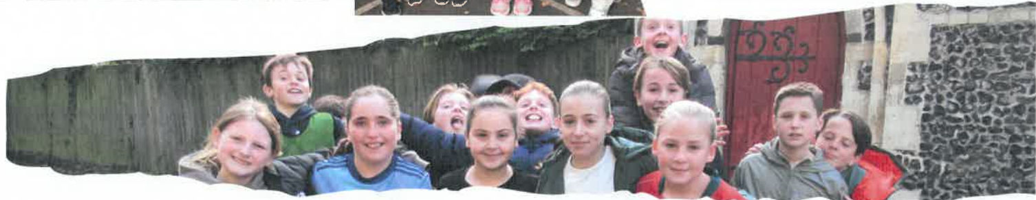
Anti-bullying Week Odd Socks Day