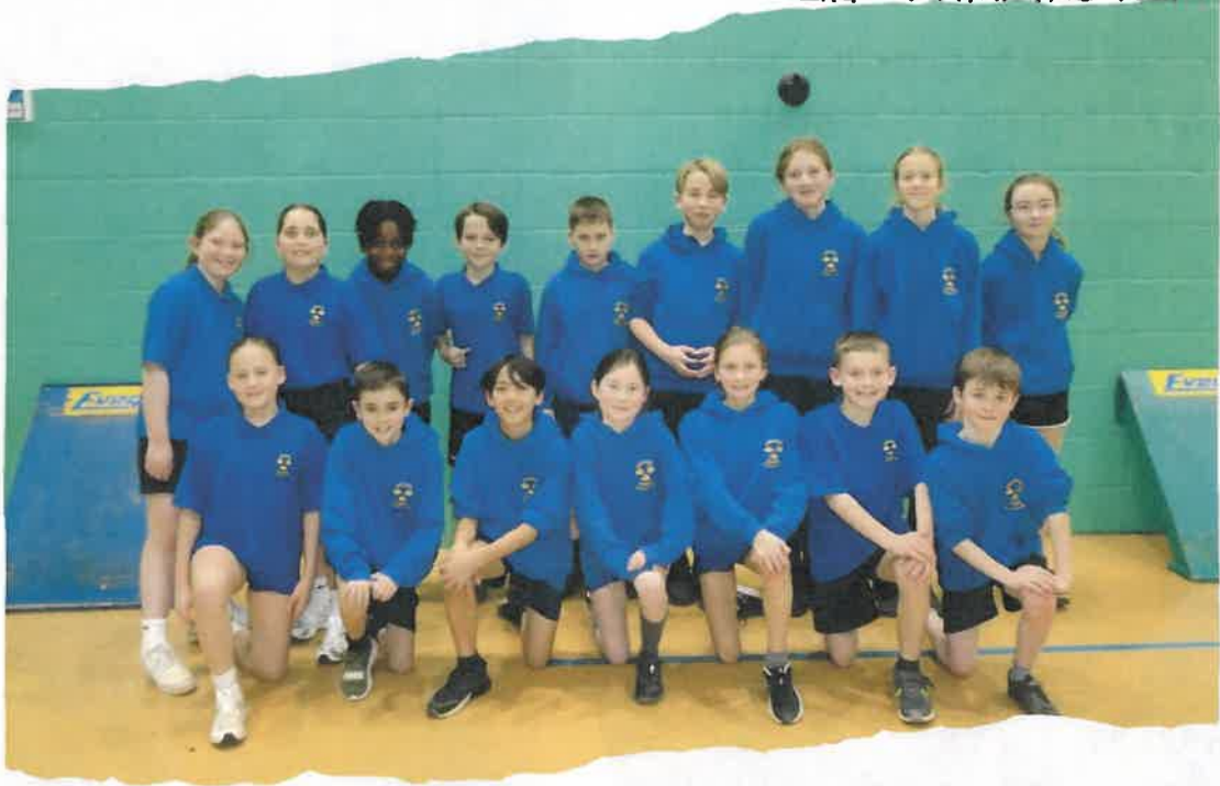
Year 4 representatives at Football