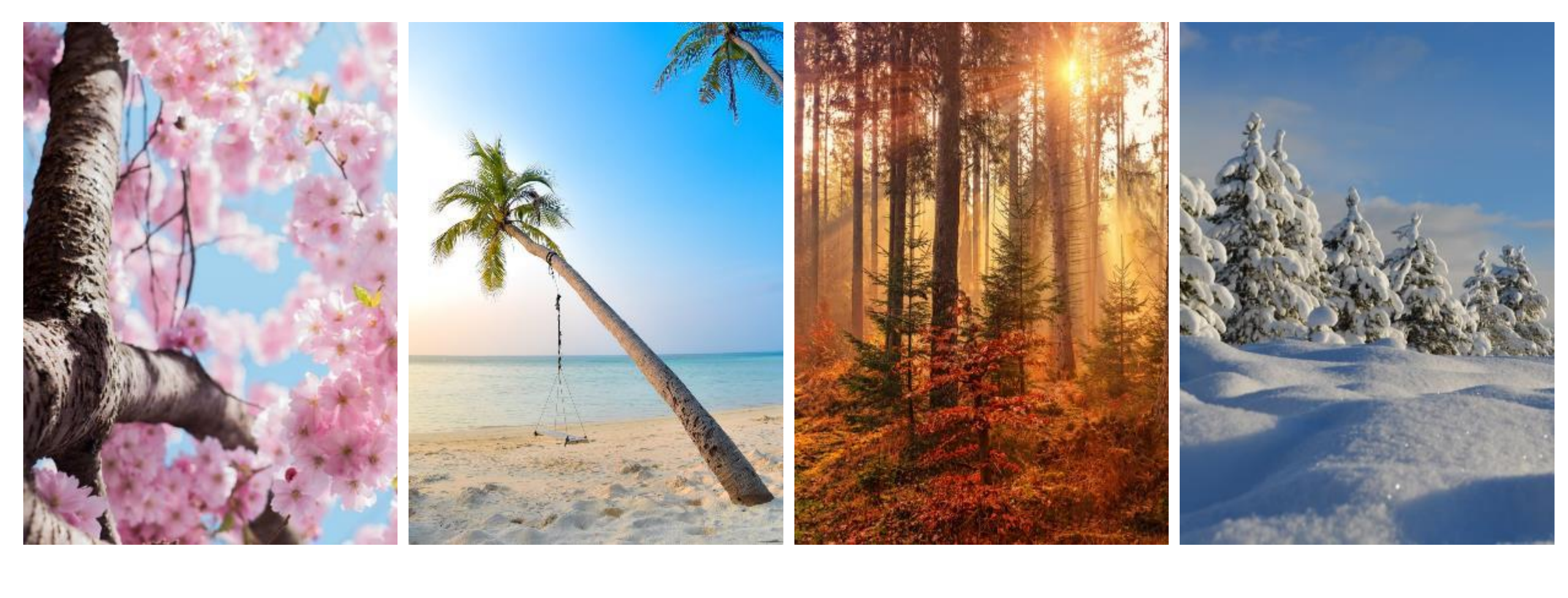
Seasons of the year