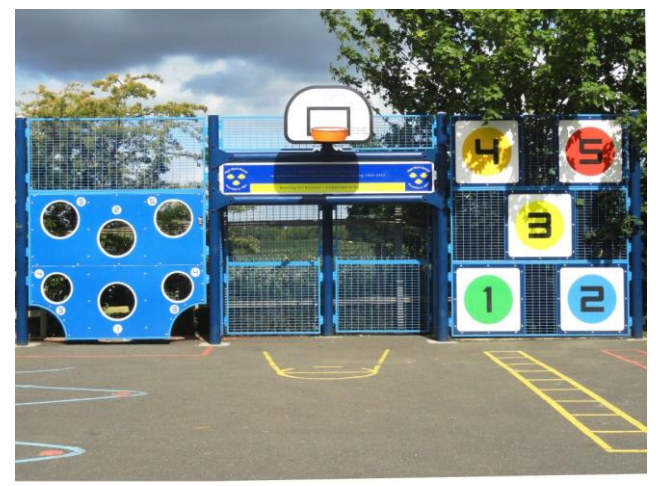
The Multi Use Games Arena (MUGA) funded by the PTA

Email at: <a href="mailto:pta@highwych.herts.sch.uk">pta@highwych.herts.sch.uk</a> or alternativly leave a message for us with the office.