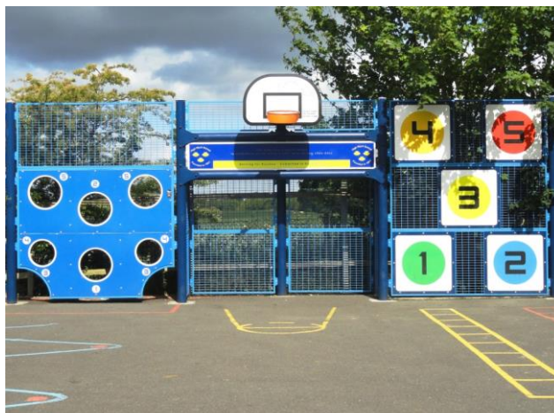
The Multi Use Games Arena (MUGA) funded by the PTA

Email at: pta@highwych.herts.sch.uk or alternatively leave a message for us with the office.